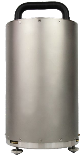
Figure 2. Example of a Güralp '3T' seismometer.

Three hybrid, three-component seismometers were commissioned at the beginning of 2017 to add redundancy to the array. To utilise the site characteristics of the Eskdalemuir array, a hybrid response for the three component seismometers has been designed. This response follows the NLNM to minimise the effect of site noise whilst maximising recording at long periods without the sensor clipping. This system has improved high frequency resolution over the velocity response. Hybrid '3T' seismometers were installed at the extremities of the array as well as within the array vault, located 1 km east of the recording laboratory.