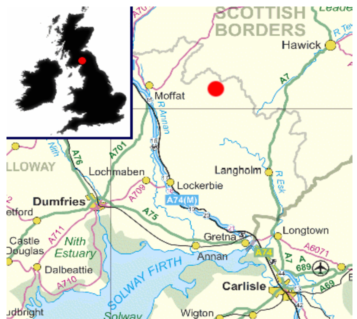
Figure 1. Map showing the location of Eskdalemuir seismic array (EKA).

Güralp Systems has been managing EKA since 2001. Beginning in 2007, Güralp undertook large scale renovation work to the stations infrastructure and equipment. The site consists of 20 pits arranged in an 18 km long linear-cross array with a central recording facility and seismic vault.