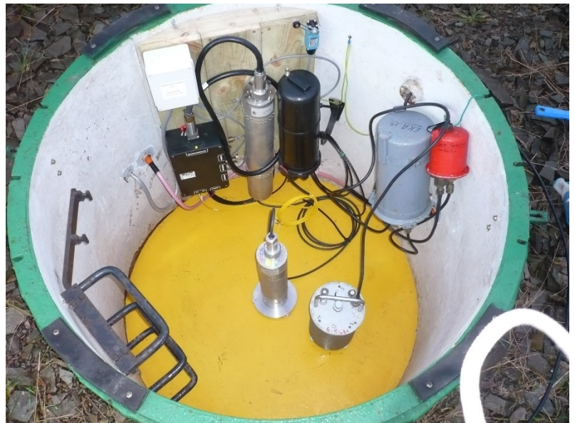
Figure 3. One of the Eskdalemuir array pits containing 3V seismometer, DM24 digitiser and acquisition system

The array seismic pits are fitted with a single component '3V' sensor connected to a DM24 digitiser and acquisition system with authentication. This is paired with a power supply module, lightning protection and fibre optic transceivers. To meet IMS specifications the 3V sensors have been built with a flat acceleration response from 20 s to 50 Hz. Original passive Wilmore Mk2 sensors continue to run within the array to provide an overlap with the Güralp feedback sensors. The feedback seismometer provides enhanced frequency range, sensitivity and stability of response.