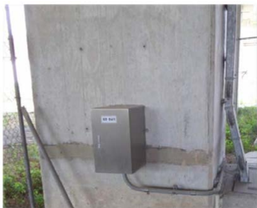
Figure 2: Example of installation, Instruments are recess in a supporting column, and a second within the hollow concrete superstructure. Each instrument is secured to the structure with a single fixing bolt.