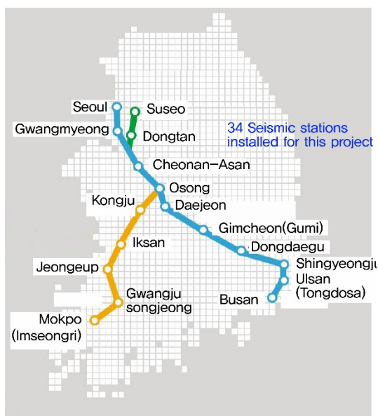
Figure 1: A map of the installations along the railway in Korea

The Korail project network was formed by the Korea Network Authority. The solution provides low latency data for an early warning system. Over 100 accelerometers and 65 digitisers make up 34 stations over 320 km of railway line. Each station contains two 5T tri-axial accelerometers, connected to the network using DM24 digitizers and data modules.