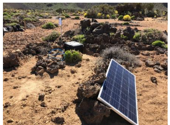
Figure 8: Example of a deployed portable station