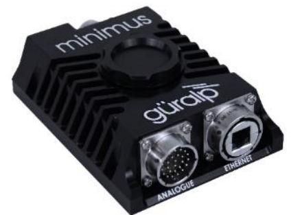
Figure 4: Minimus digitiser

In addition to the Radian, the Minimus can also accommodate an additional analogue sensor such as an accelerometer.