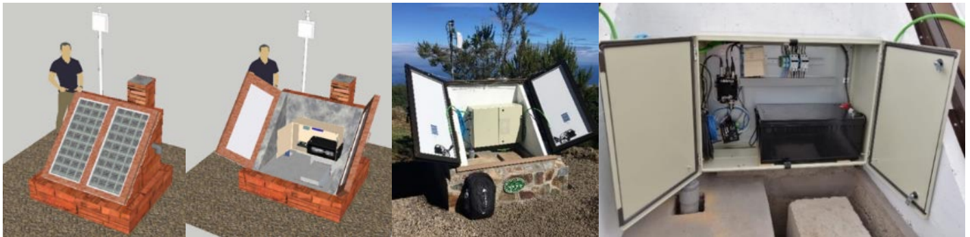
Figure 6 & 7: Schematic of the permanent station design showing solar panels and internal components