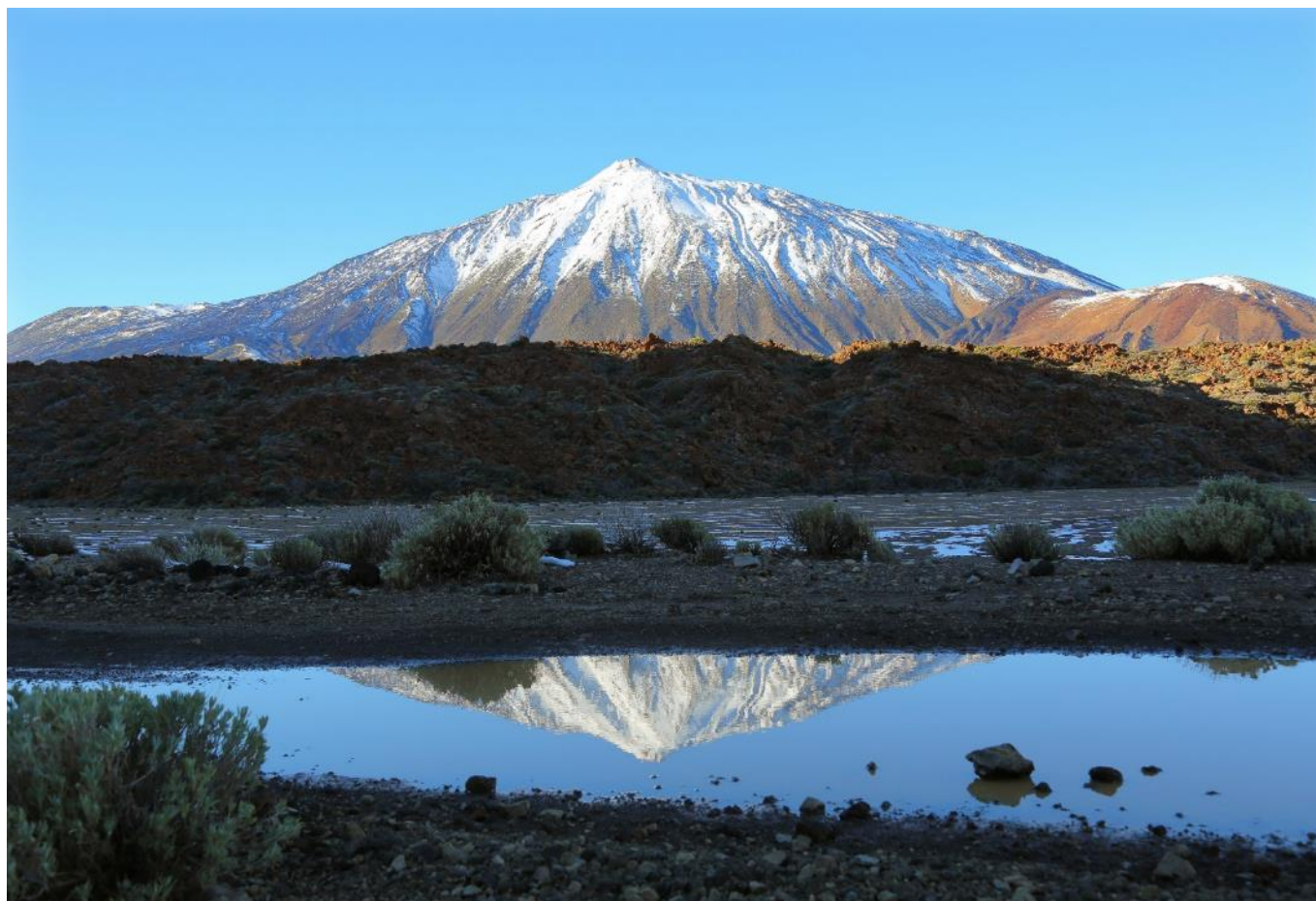
Figure 1: Mount Teide volcano, Tenerife