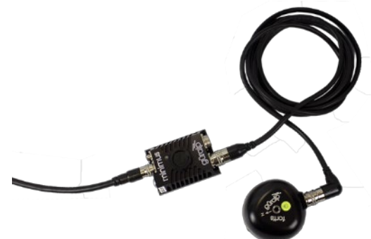
Figure 5: Minimus digitiser connected to additional analogue sensor (Fortis Accelerometer)